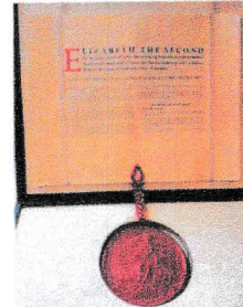
The current BBC Royal Charter, held at the BBC Written Archives Centre